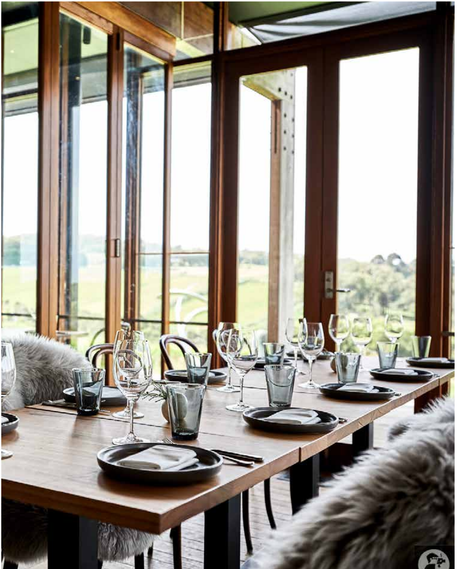
Private Dining Room