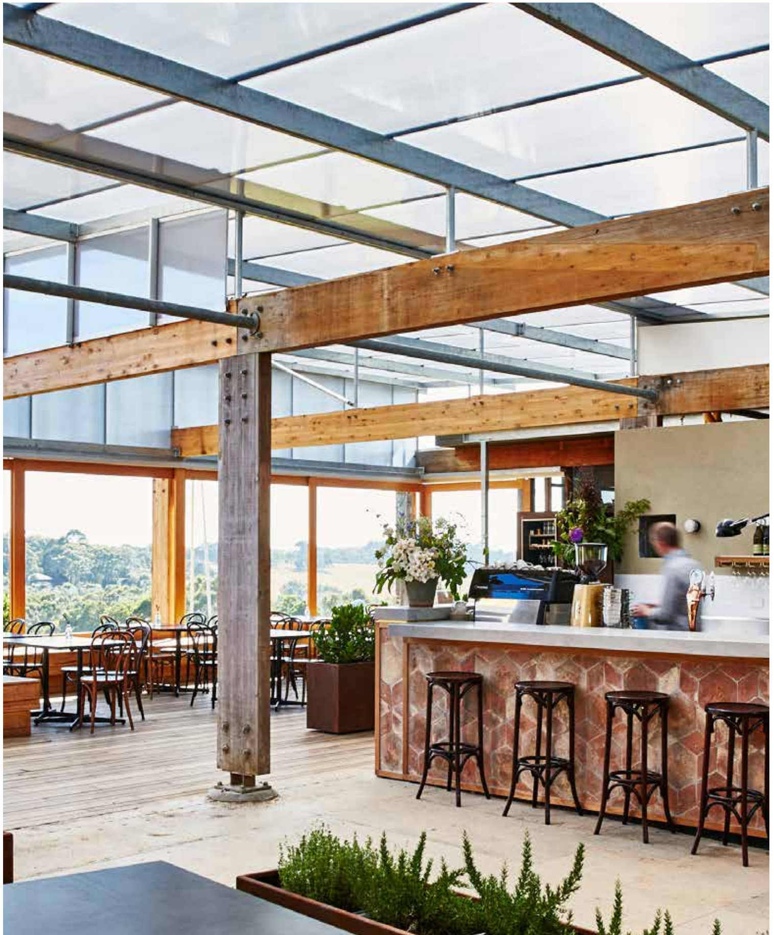
Piazza Exclusive Use